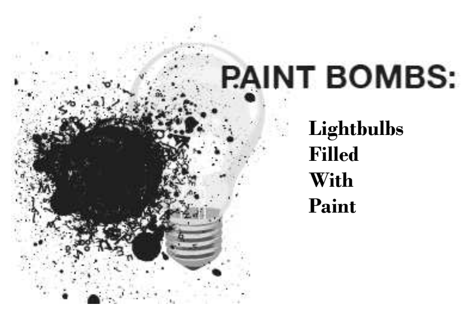
First, put on your cloth gloves. This will keep your fingertips (and the paint bombs) clean. You should work on a soft surface (like a fold towel) to protect your bulb.

harder time identifying masked faces in their post-G20 Most Wanted list than those without, just as the police would have had a harder time arresting people in the aftermath of the Vancouver hockey riot if the hooligans had been wearing masks. Wearing masks won't get us home safely all the time, but it does disrupt routine repression and social control.