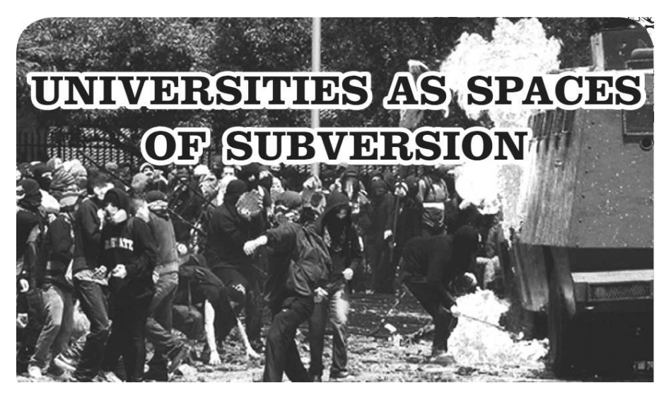
Around the world, universities have played a roll in contributing to wider social struggles.

In Chile, the police do not come onto the university campuses. When the dictatorship came to power in the coup of 1973, the enforcers of law and order entered the campuses and rounded up those opposed to the coup, imprisoning, torturing, and executing hundreds. Even though the dictatorship is now officially over, democracy has proven itself not much different to those who oppose hierarchy and power.